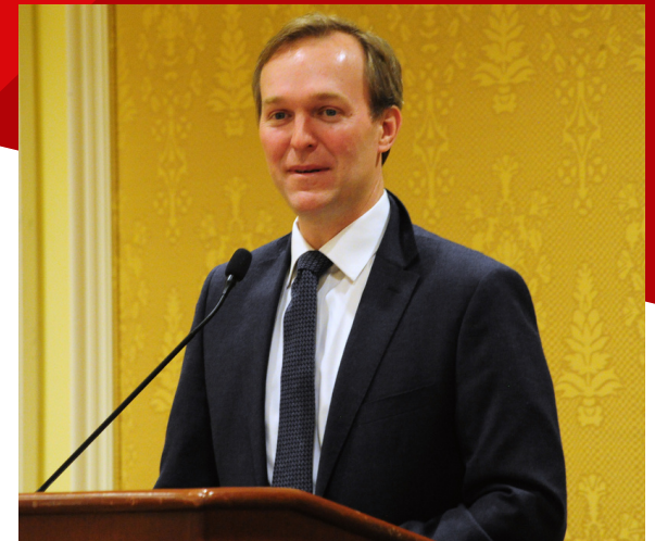
2020 Keynote Speaker Former Congressman Ben McAdams